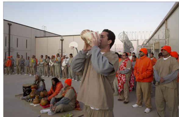
figure d: A Native Hawaiian inmate at Saguaro Correctional Center, in Eloy, Arizona, blows a conch shell to honor the Hawaiian season of Makahiki, a season historically associated with Lono, the god of peace and fertility.