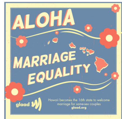
figure c: GLAAD graphic highlighting the “aloha spirit” in passing SB1.

With the statement, GLAAD released a minimalistic graphic reading “Aloha Marriage Equality,” celebrating the passage of marriage equality in Hawai‘i. GLAAD was not the only organization deploying aloha discourse and equality