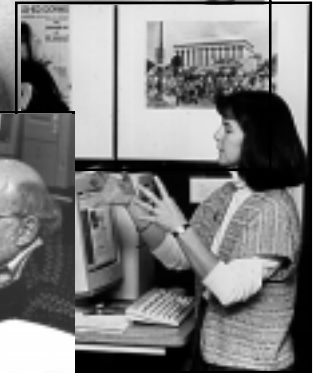
Scenes from the Library/OCTET Workshop