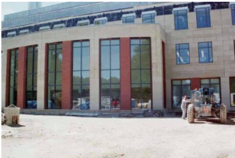
North View of the Science Library

Oberlin’s new Science Library is now open for the use of the College community. Located in the heart of the College’s new science complex, the 12,580 square foot library offers greatly expanded space for the collections and more than triples the number of reader spaces that were available in previous science library facilities. The library features an electronic classroom with 15 workstations and seating for 30 students, two group study rooms, and a variety of seating and work areas. Over 100 study spaces, including carrels that will be assigned to science majors, have direct connections to the campus network.