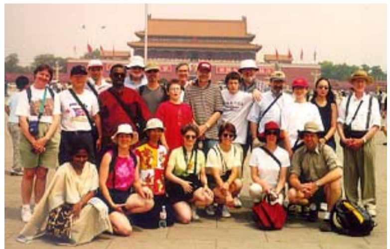
Oberlin Delegation at Tiananmen Square