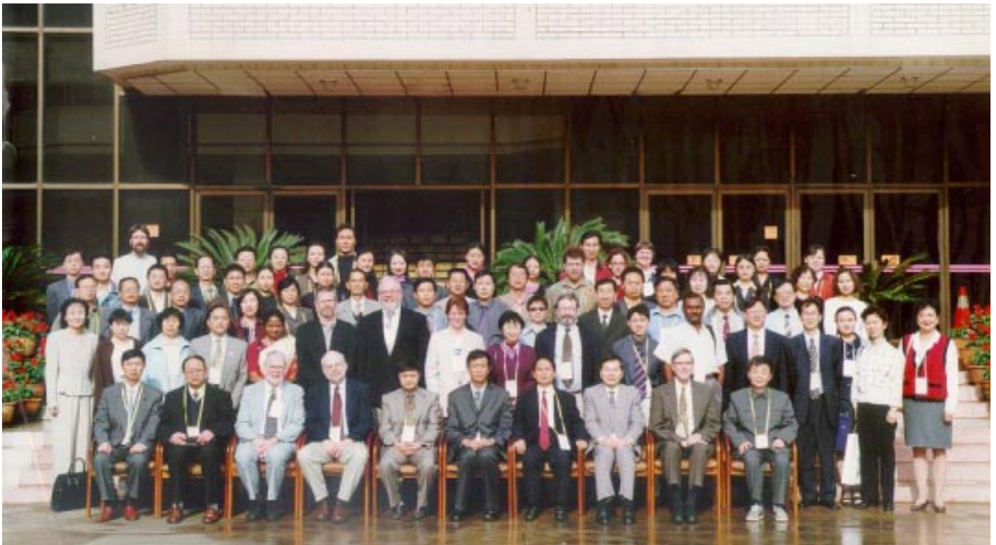
Participants in the International Conference